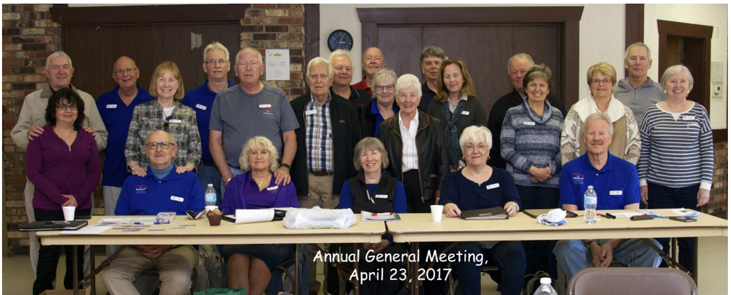
Annual General Meeting, April 23, 2017