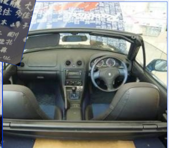
Car being signed by attendees at 10th Anniversary meeting.