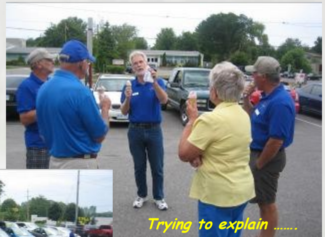
Trying to explain .....