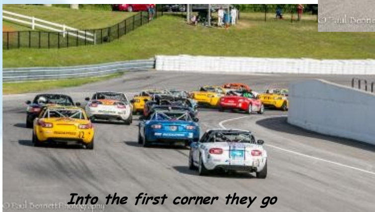
Into the first corner they go