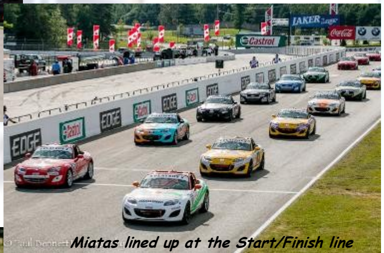
Miatas lined up at the Start/Finish line