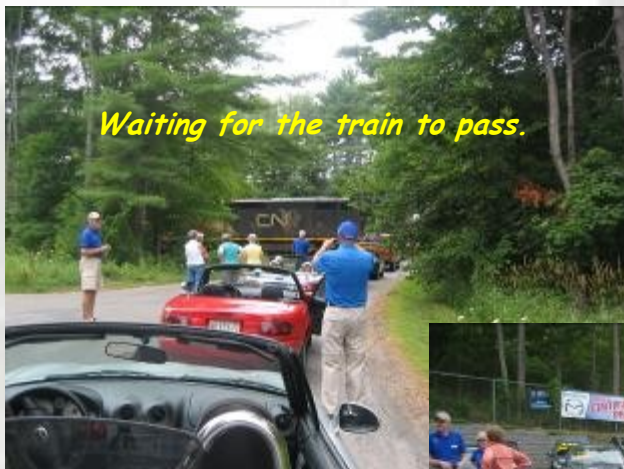
Waiting for the train to pass.