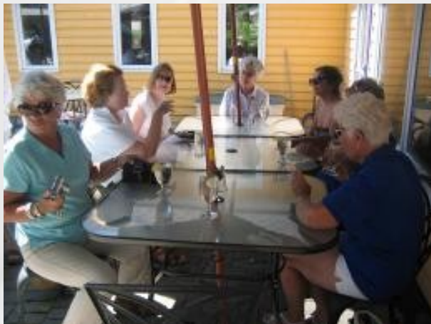
Lunch at Just Crêpes