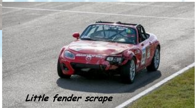
Little fender scrape