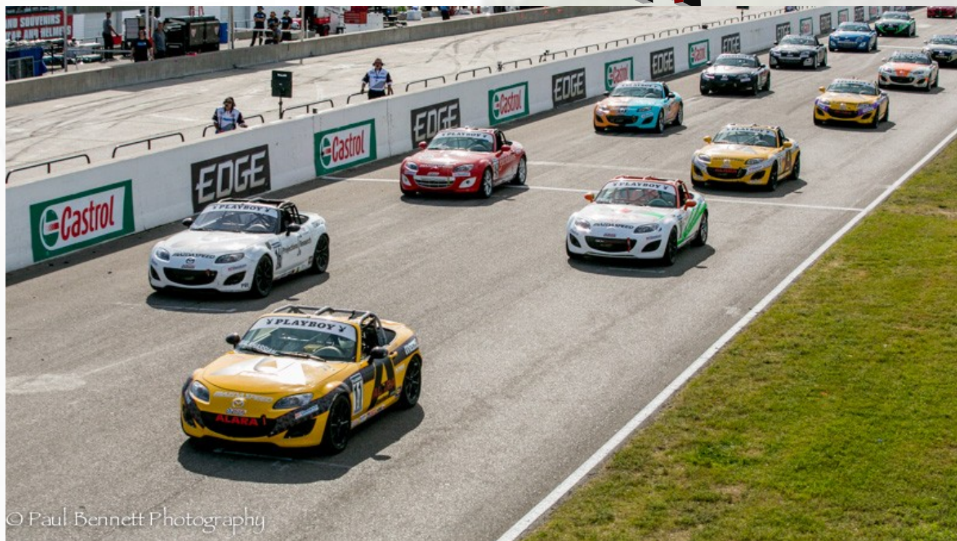
Miatas invade Mosport Park