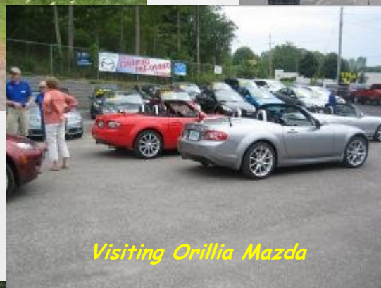
Visiting Orillia Mazda