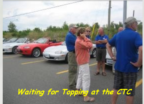
Waiting for Topping at the CTC

Although rain threatened on and off there was just a gentle sprinkling at the Little Red Caboose where the PRHT owners got show off a little. Approximately 10-15 minutes later all had stopped so it was time for the soft top owners to show off. All arrived at the Giggs in time to enjoy a beverage and some hamburgers/hotdogs before the storm swept in off the lake. As always everyone seemed to enjoy themselves and our thanks go out to the Landers and the Giggs for coordinating such a fun event.