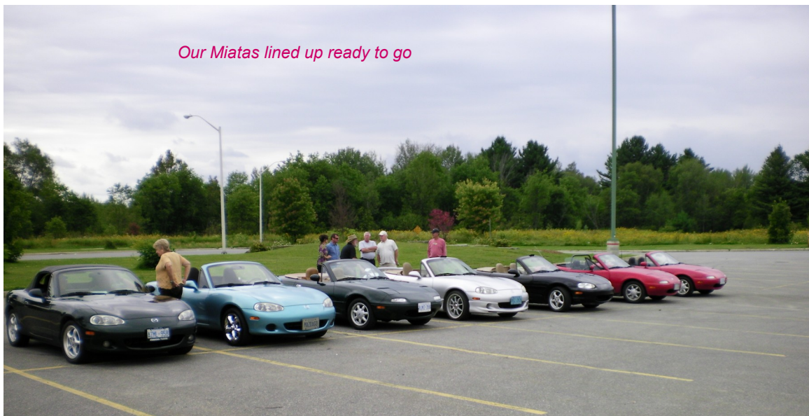
Our Miatas lined up ready to go

On August 25th under threatening skies, the Miatas of Muskoka held its first organized event by exploring the Haliburton Highlands. The weather cooperated however, allowing the 12 members who attended the opportunity to get to know one another better as well as stretch the legs of their Miata.