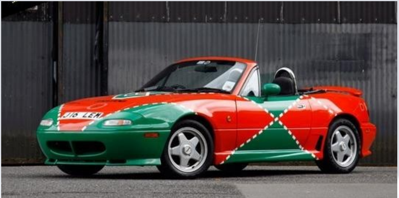
No trouble finding this baby in the parking lot.