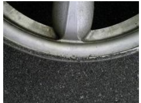
Close up of Curb Rash

The first thing was to scrub the wheel with dish detergent and a stiff-bristled brush, rinsing thoroughly. I made sure to clean enough of the backside so you as not to drag dirt on to the front., when finished there was no debris or dirt anywhere on the wheel.