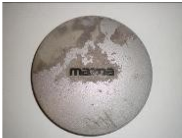
Cap looked like this

The wheel centre cap looked horrible with flaking paint and a large discoloured area. After lightly sanding the cap I prepped it for paint by masking off the Mazda script in the centre of the cap and filling the black letters with Vaseline. I then removed the masking tape leaving on the Vaseline filling the indented lettering. After a light coat of primer to remove the discoloured area it was followed by a colour coat. After the paint dried I simply washed the cap in hot water to remove the Vaseline.