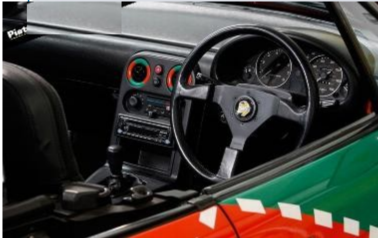
Interior shot shows some neat details (note vents, steering wheel).