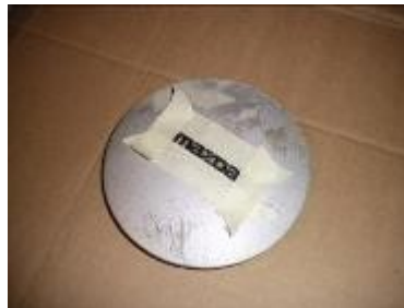
Logo masked & filled with Vaseline