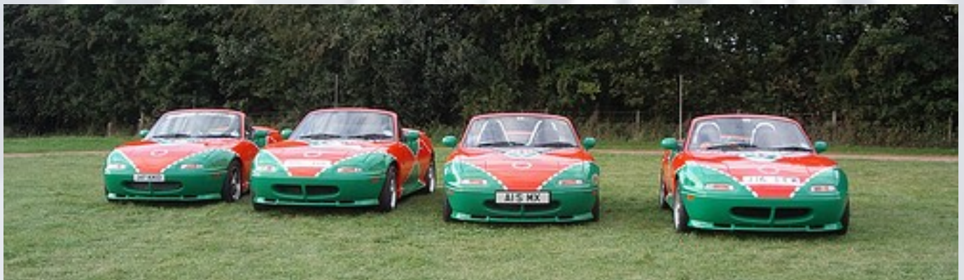
Only 24 produced and 4 of them at one event, how neat is that?