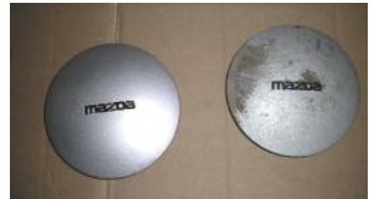
Finished cap on left vs non finished cap