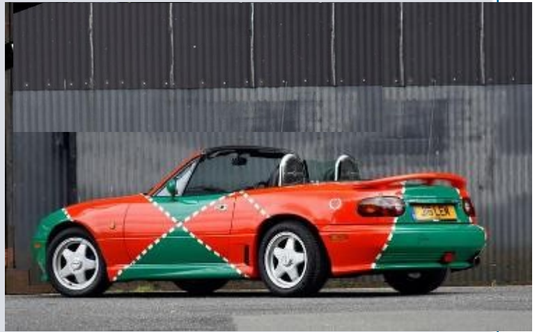
MX 5 Le Mans edition had exclusive "Tupperware" with split grill, unique rockers, spoiler and side scoops.