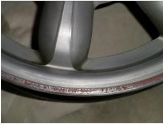
Curb Rash cleaned, filled, sanded, ready for primer

After drying, I was then able to wet sand it with a 240-grit sandpaper, followed by a 400 grit until the surface looked and felt flush. I sanded the rest of the wheel.