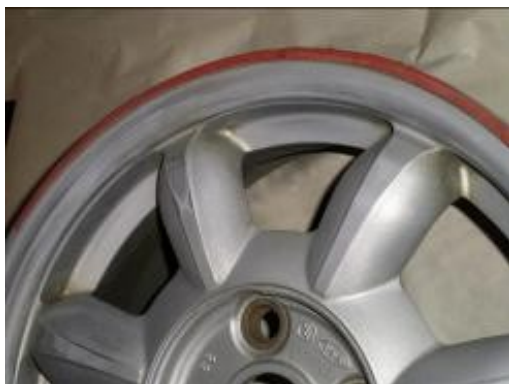
Spot putty applied

The first thing was to scrub the wheel with dish detergent and a stiff-bristled brush, rinsing thoroughly. I made sure to clean enough of the backside so you as not to drag dirt on to the front., when finished there was no debris or dirt anywhere on the wheel.